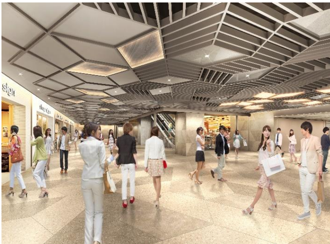
Computer-generated image of the retail facility area on the first basement floor of Tokyo Midtown Yaesu

Tokyo Midtown Yaesu is the third Tokyo Midtown brand property, following on from Tokyo Midtown (Roppongi) (Location: Minato-ku, Tokyo) and Tokyo Midtown Hibiya (Location: Chiyoda-ku, Tokyo). Tokyo Midtown Yaesu will emerge in the Yaesu neighborhood, which is literally a gateway to Japan. As well as being a major Shinkansen terminal with services around the country, it is a diverse mobility hub for subways, buses, and other modes of transportation. Beginning with the opening of Tokyo Midtown Yaesu and Bus Terminal Tokyo Yaesu, Mitsui Fudosan will redouble its efforts to foster further vibrance in the Yaesu area, which will serve as a new gateway in Tokyo that Japan can boast of to the world, together with collaborations with facilities around Tokyo Station and redevelopment projects that are currently under way.