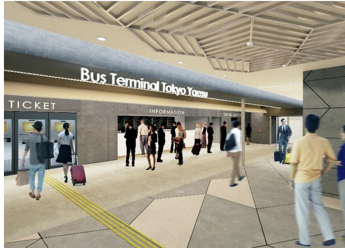
Computer-generated image of the information desk and ticket counter of Bus Terminal Tokyo Yaesu

Bus Terminal Tokyo Yaesu, which will be located on the second basement floor, brings together all the highway bus stops currently spread out along the sidewalks near Tokyo Station through collaboration of the three Tokyo Station district urban redevelopment projects. Bus Terminal Tokyo Yaesu is the Phase 1 area of what will be one of Japan's largest bus terminals for highway bus services linking Tokyo with international airports and regional cities, with a total of 20 berths when combined with the adjoining two zones. This bus terminal is being developed by the Urban Renaissance Agency (Independent Administrative Agency) (hereinafter, "UR").