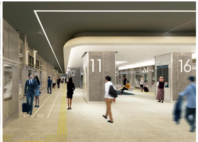
Computer-generated image of the departure concourse of Bus Terminal Tokyo Yaesu

Among the retail facilities on levels from the first basement floor to the third aboveground floor, 13 stores will be located on the first basement floor that is set to pre-open. These stores will be centered on convenient and diverse restaurants and cafes that have a strong affinity with visitors, domestic and foreign tourists, and bus terminal users, as well as nearby office workers.