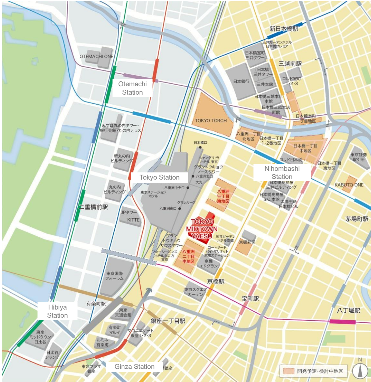
Eastside area of Tokyo Station 'EATS' (Eastside area of Tokyo Station)