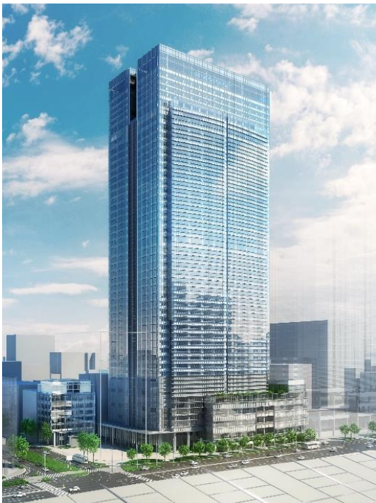
Perspective drawing of completed building