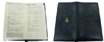
Group Compliance Policies recorded in an employee handbook

The employee handbook includes a clear description of Group Compliance Policies. We also strengthen compliance and ensure broad dissemination of information by issuing Compliance news to all employees when appropriate. This news covers topics specified in the Compliance Manual (based on the Mitsui Fudosan Group Compliance Policy) such as eliminating organized crime, preventing money laundering, eliminating unfair transactions (abuse of superior bargaining position), preventing insider trading, prohibiting gifts and entertainment, and duty of confidentiality regarding company information.