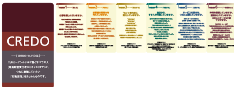
This Credo summarizes the policies followed by employees of The Celestine Hotels and Mitsui Garden Hotels (Mitsui Fudosan Hotel Management)

At Urban Dock LaLaport TOYOSU and other commercial facilities, we are renovating employee lounges with a relaxing café concept, to enhance their effectiveness as spaces for rest and rejuvenation. Going forward, we will continue our efforts to create work environments that raise employee motivation.