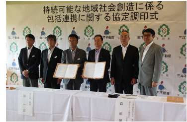
▶ Signing ceremony with Shimokawa Town, Hokkaido