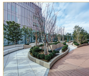
► Sky Garden

Wall and roof foliage extends from Parkview Garden (6th floor) to Sky Garden (9th floor)