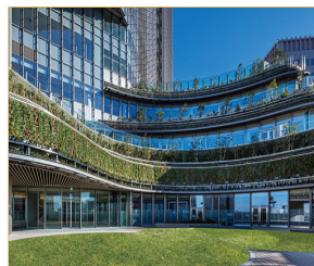
► Wall and roof foliage

Greenery and water features on the terrace give visitors the sense that they are part of Hibiya Park with its stunning foliage spread out below.