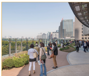
► Parkview Garden

Greenery and water features on the terrace give visitors the sense that they are part of Hibiya Park with its stunning foliage spread out below.