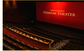
► TOHO Cinemas Hibiya

With its Hall, Kitchen, Studio, Lounge, and Café, BASE Q is an ideal springboard for business collaboration.