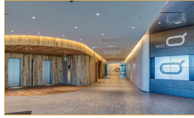
► BASE Q

A stairway leads to a circular plaza roughly 30 meters across, suitable for various events and activities