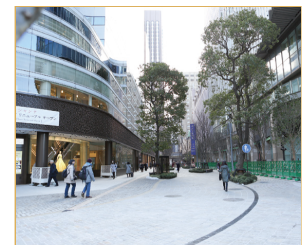
► Pedestrian walkway with abundant greenery

This aerial oasis of greenery is located near ninth floor office space and adjacent to the Sky Lobby.